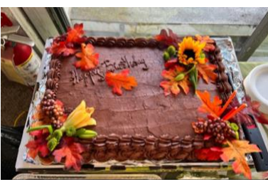
Happy Birthday Malcolm!