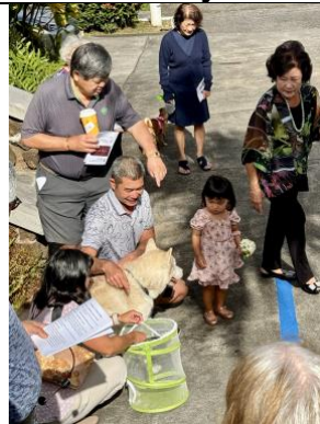
Removing the butterflies for release