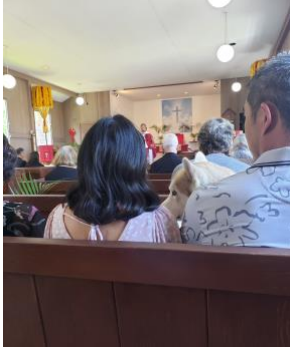
Full house with pets!