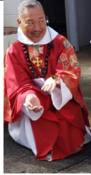
Butterfly on hand!