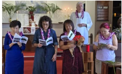
Passion Gospel readers!