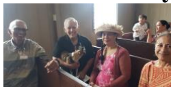
Na kanaka enjoy the olelo weaved into the liturgy like a lei