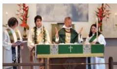
At the altar