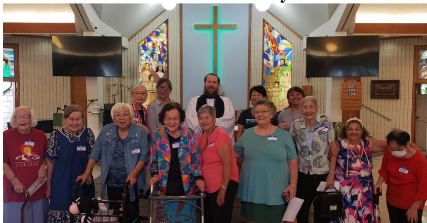
Episcopal Church Women (ECW) at St. Mary's!