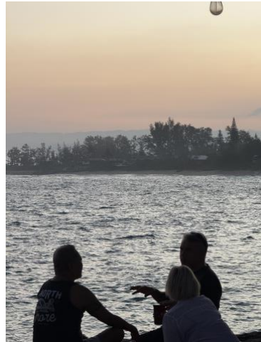
Early morning by the ocean