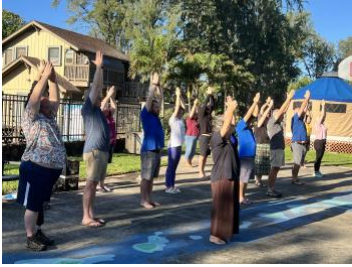
Tai chi exercise