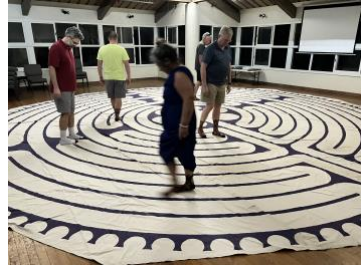
Walking the labyrinth