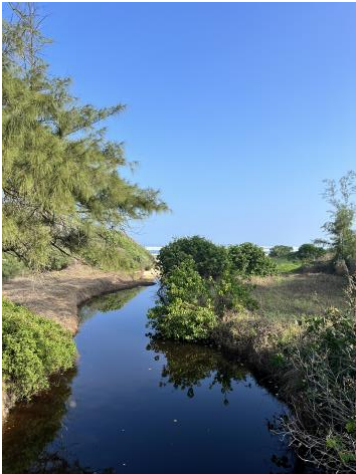
Stream at the end of the camp property