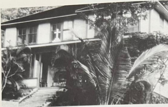
Good Samaritan Church in Honolulu, Hawaii - 1930.