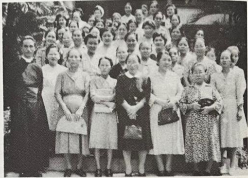
After a prayer meeting for the Japanese - American GI's at the Good Samaritan Church, Honolulu, Hawaii, 1944.