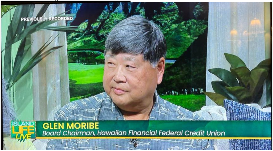
Our very own Jr Warden was in the news, giving tips for saving money!