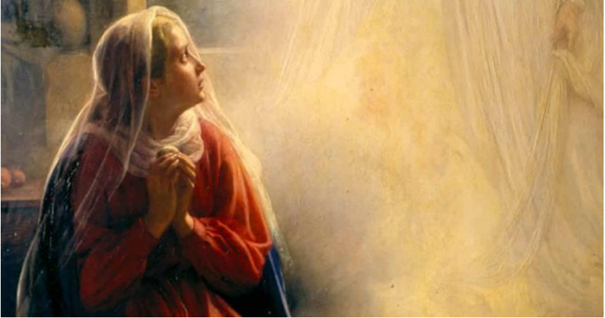
The angel Gabriel comes to Mary