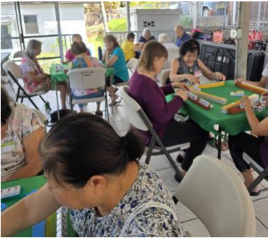
Five full tables at mahjong!