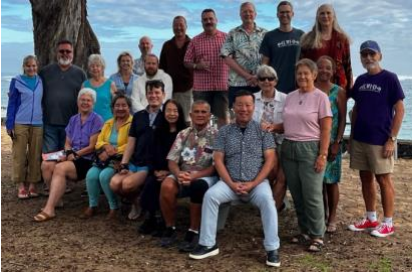
Clergy Retreat at Camp Mokuleia