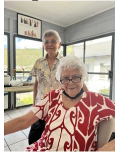
Tiny and Theone!