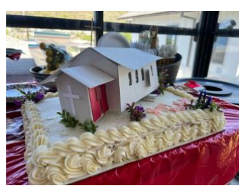
Red Velvet Cake by Vel!