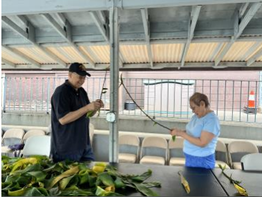
Learning to make ti leaf lei for Memorial Day. 1000 is our yearly goal!