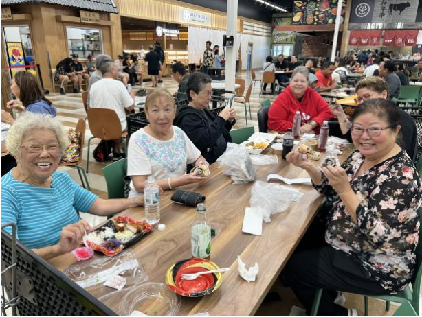
Field trip to Don Don Donki in Kapolei! Delicious bento lunches!