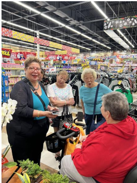
What a fun experience, the store will never be the same!