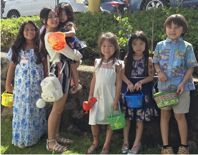
Easter egg hunt was enjoyed by the keiki!