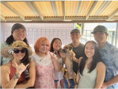
Hee ohana at the spring fair!