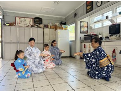
Japanese dance class started!