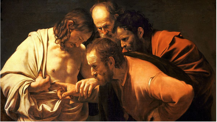
Jesus Appears to His Disciples