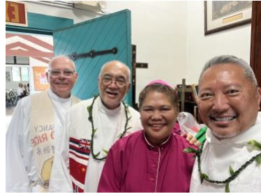
Good Shepherd, Maui