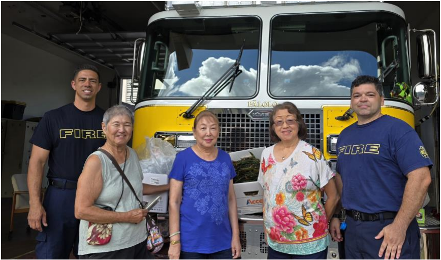
1000 ti leaf lei delivered to Pālolo Fire Station for Memorial Day, Punchbowl Cemetery! Mahalo ladies!