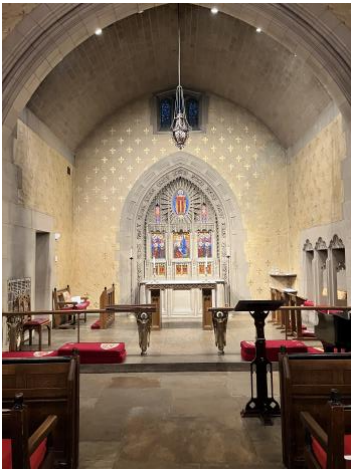
Fr Hee visited the Church of the Heavenly Rest, side chapel, in New York