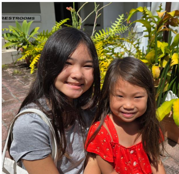
Youth and young adults of Good Sam!