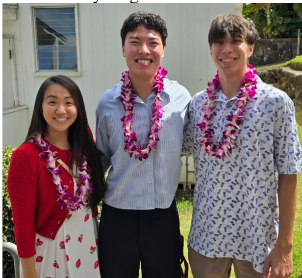
Our future is looking bright and blessed!