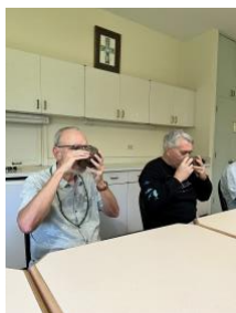
Bishop at awa ceremony