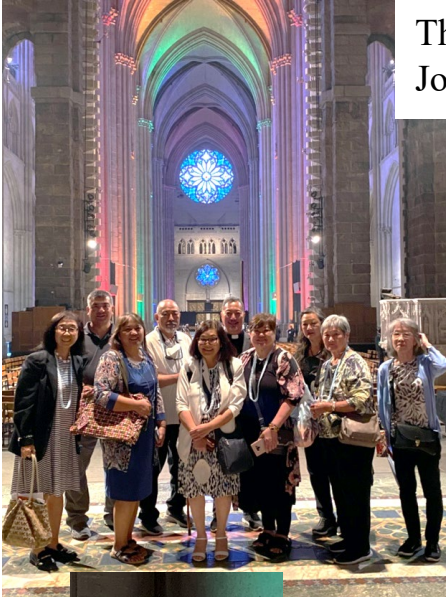
The Cathedral Church of St. John the Divine, New York