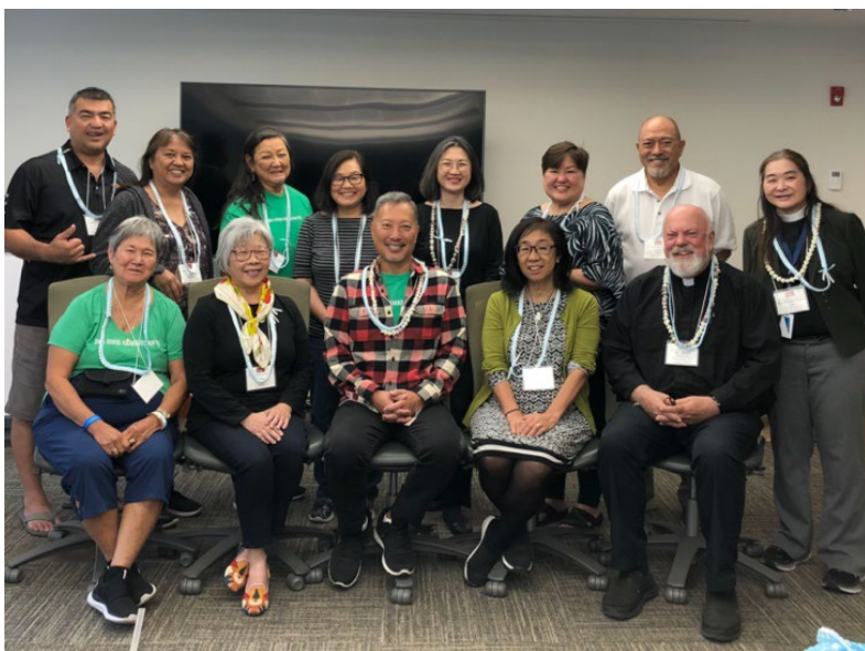
Official meeting at the Episcopal Church Center on 2 nd Ave., the same building where the Presiding Bishop resides.