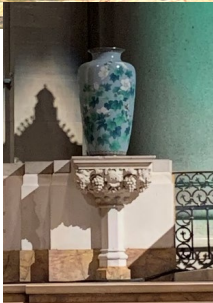
One of two vases displayed at the altar from Emperor Hirohito of Japan in 1926.