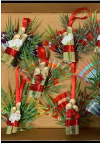
Kadomatsu Fan Ornament ($8)