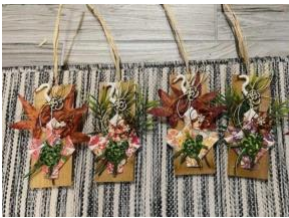
Door hangers ($15)