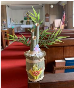
Tabletop Kadomatsu decoration ($15)