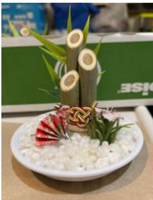
Mustard dish tabletop decoration ($10)