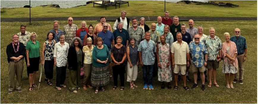
Clergy Conference at Naniloa Hotel in Hilo, Big Island

Recent events from our church, community, and Diocese!