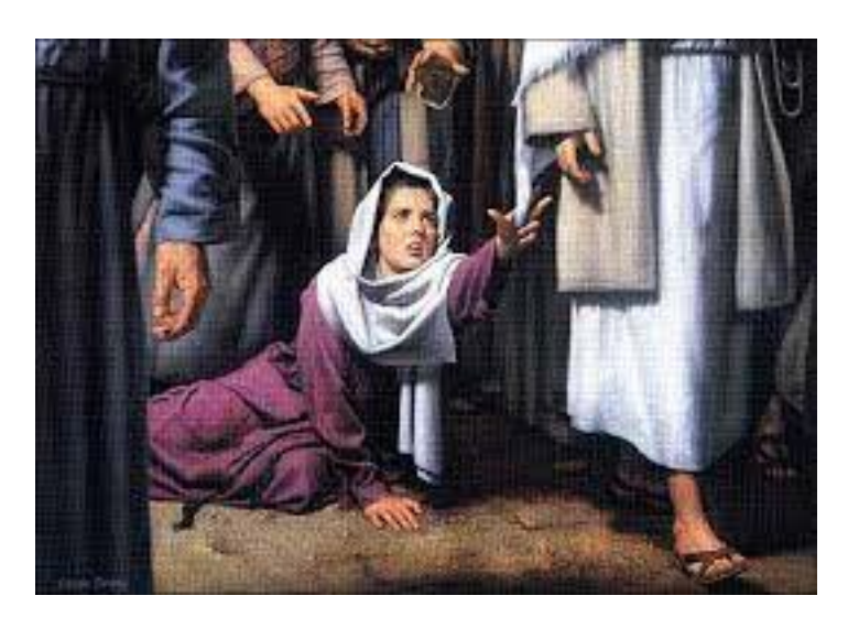
The Faith of a Canaanite Woman