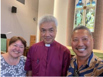
Bishop of Kyushu

Pictures from the Hidden Christians Pilgrimage, Japan: