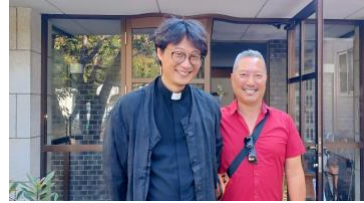
Episcopal priest of three churches