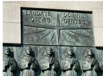
26 Martyrs Museum