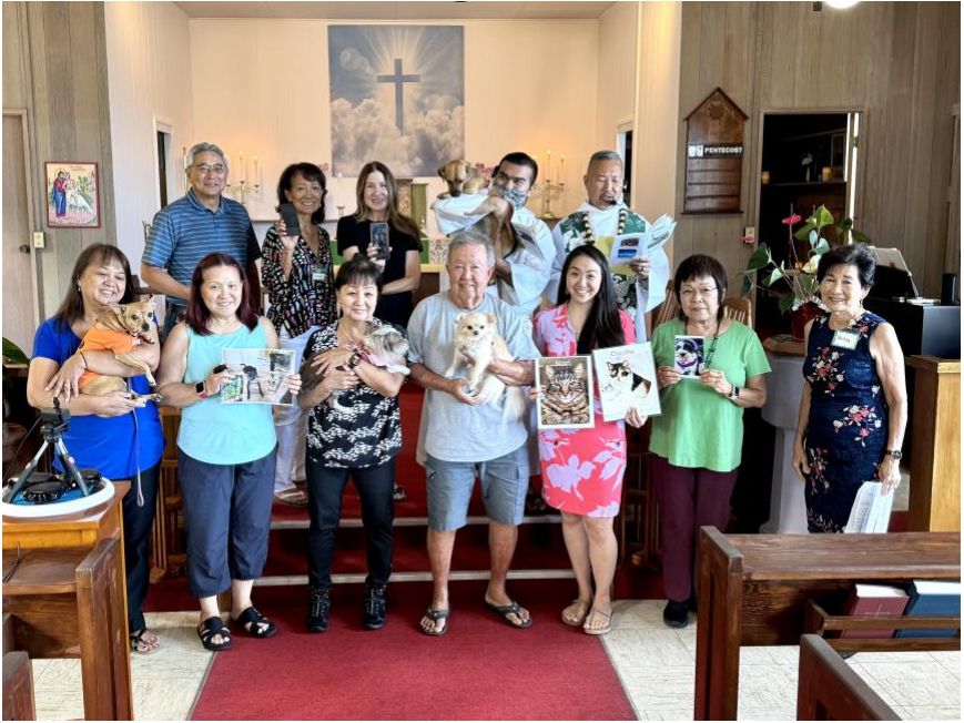
Pet blessing for our beloved animals!