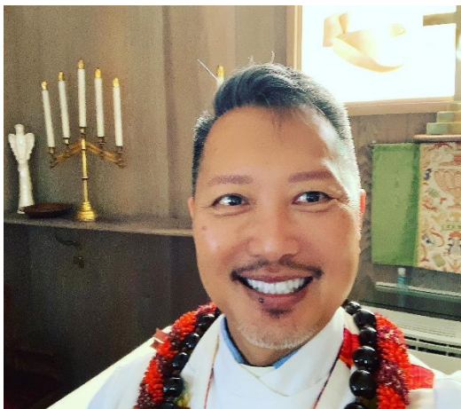
Picture taken on Sunday, September 5, 2021, his first day at Good Samaritan as the new Vicar.