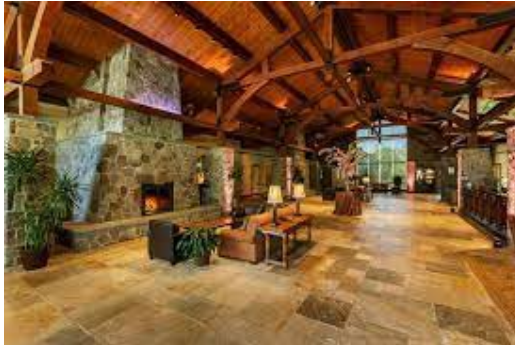
Pictured: Sleepy Hollow Hotel and Conference Center